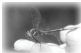
The Hines Emerald Dragonfly

Center For Biological Diversity are both planning on challenging this exclusion along with other issues. DCEC has signed on in support of the proposed litigation. A 60-day notice of intent will be filed in early November, and litigation is planned for early 2008.