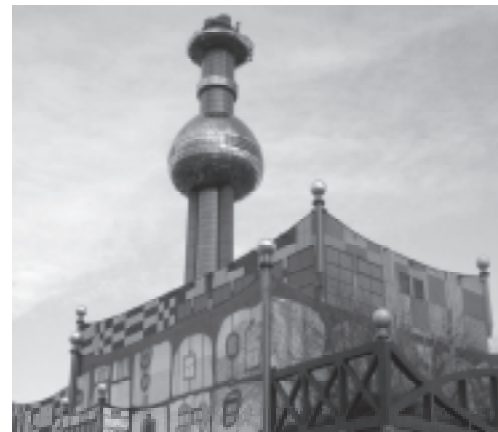
A garbage fueled power plant in Vienna, Austria. Who says they have to be ugly?